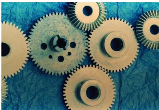
FIGURE 1. Type captions for figures directly below the space allowed for the materials, leaving two blank lines between the figure and the first line of the caption. Please type captions for figures and tables in 8 point font size.

All figures, graphs, tables, photographs, equations, and illustrations should generally fit to one column. However, if they cannot be reduced to one column, place them across two columns at the top or bottom of the page. NOTE: Figures, tables, etc. should fit on one page within 1" margins. Insert them into the body of your paper in order of reference. All captions (except tables) must be placed right below the figure being described using 8 point font. Multicolored figures, graphs, tables, photographs, and illustrations are acceptable and encouraged.