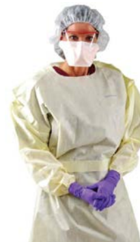
FIGURE 3. Isolation gown with an abdominal tie

Several design issues exist with the current isolation gowns. According to ANSI/AAMI PB70 [56], the entire isolation gown, including the seams, but excluding the cuffs, hems and bindings, has to achieve a barrier performance of at least Level 1 which is the lowest barrier performance defined by ANSI/AAMI PB70. However some isolation gowns available on the market are made using an open-back design due to comfort concerns, but these gowns cannot be ANSI/AAMI PB70 rated. Also, the back of some gowns are not designed in such a way that there is an overlap of the fabrics in the back of the body, as in the case with surgical gowns. Due to this design, if the garment does not fit the HCW properly, this may cause an opening at the back of the garment which can be critical for blood/OPIM transfer. Ties on the abdomen or torso ( Figure 3 ) are a common feature used for isolation gowns; however, it has been determined that they are not tied properly or sometimes not tied at all, which may cause other hazards. The isolation gown ideally should not restrict the movement of the body and should be breathable and comfortable to wear for long periods.