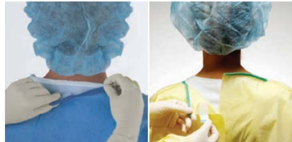
FIGURE 2. Different neck closures for isolation gowns (hook and loop and tape tab neck closures from left to the right)

There are generally three types of neck closure used on the market for isolation gowns: Tie, tape tab, and hook and loop neck closures (see Figure 2). Some gowns featuring hook and loop neck closures are manufactured for easy adjustability, and tape tab neck closures are for ease and reduce the time for donning and doffing. Gowns featuring a hook and loop style neck closure allow the neckline to easily adjust to variety of sizes. Neck closures and donning difficulty are identified as some of the most common issues with isolation gowns according to a survey conducted among HCWs recently [59]. An isolation gown should be designed in such a way that it fits the HCW and offers ease of donning and doffing, as the time needed for putting on and removing can be especially critical for emergency room personnel or EMS workers.